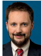
Pete Sepp National Taxpayers Union President

Sepp was instrumental in pushing Republicans to get behind the IRS Funding Accountability Act, which would require the agency to update Congress on its spending plans.