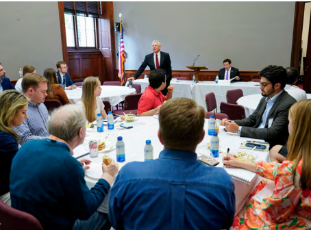
Rep. David Schweikert (R-AZ) spoke at NTUF's inaugural Taxpayers FIRST event titled "Recommendations for Assessing, Addressing, and Ameliorating the Tax Gap."