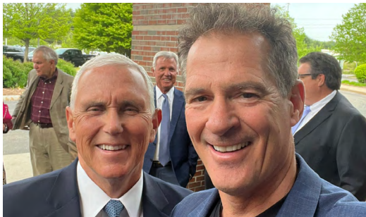
Competitiveness Coalition Chair Scott Brown with former Vice President Mike Pence at our event in New Hampshire.

We launched a strategic campaign in New Hampshire with the Josiah Bartlett Center that included a statewide poll of GOP voters and sponsorship of a series of interviews with presidential candidates. Ron DeSantis, Nikki Haley, Chris Christie, and Vivek Ramaswamy discussed their thoughts on antitrust and competition policy.