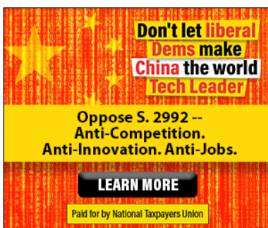
The Competitiveness Coalition Sponsored Politico Morning Tech.

Early in 2022, NTU helped launch the Competitiveness Coalition, a first-of-its-kind endeavor to preserve America's global competitiveness and leadership. The Coalition is chaired by former U.S. Senator and Ambassador Scott Brown, who has helped garner considerable attention from Capitol Hill and the media. The 19 members of the Coalition include prestigious organizations and individuals committed to the idea that free market principles are inherent to the nation's well-being.