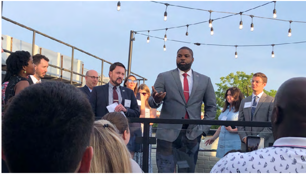
NTU Hosted a Summer get-together featuring remarks from Representative Byron Donalds (R-FL).